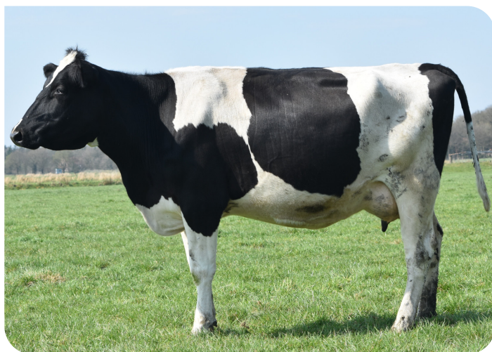
Mosel (s. Bouwe 9)

Owner: Landwirt. Betrieb Gruben, Nortmoor (DE)