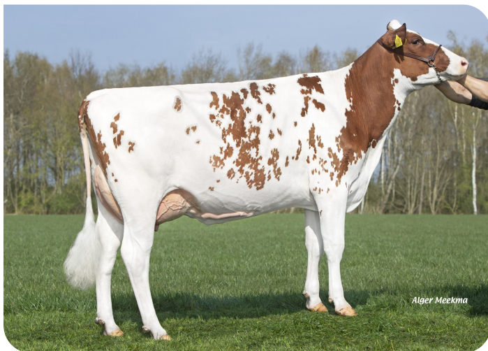
Glinzer Gerie 222 (s. Red Max) Owner: Fok- en melkveebedrijf K.I. Samen B.V., Grashoek (NL)