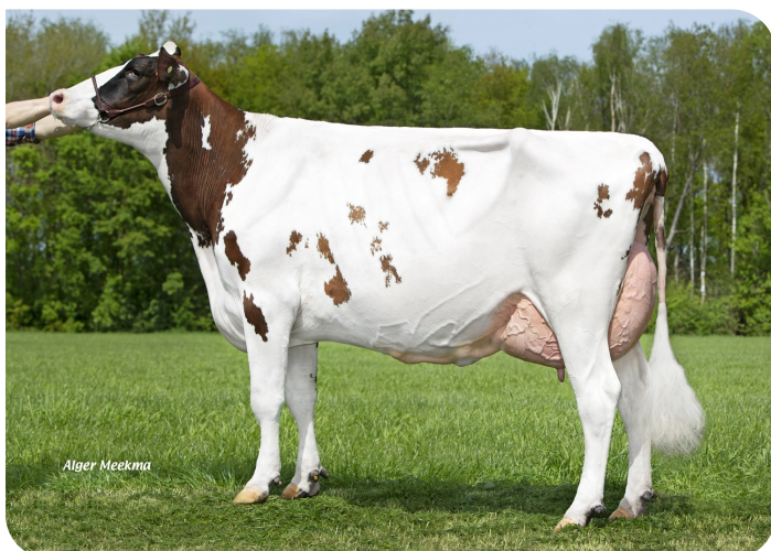
Grashoek Anna-Jacoba 13 (s. Dex) Owner: Fok- en melkveebedrijf K.I. SAMEN B.V., Grashoek (NL)