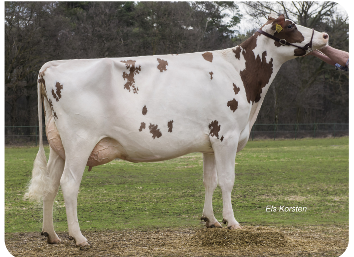
Massia 9857 van de Peul (EX91) Dam of Dex