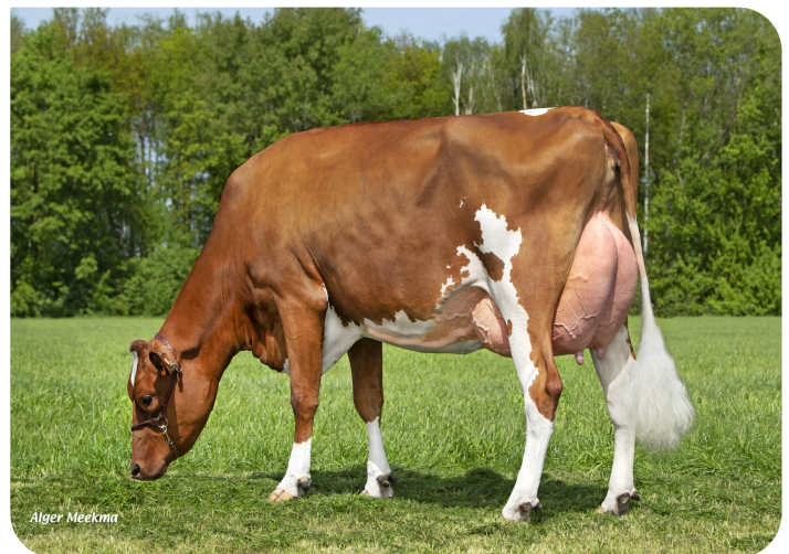
Grashoek Nordika 25 (s. Dex) Owner: Fok- en melkveebedrijf K.I. SAMEN B.V., Grashoek, Grashoek (NL)