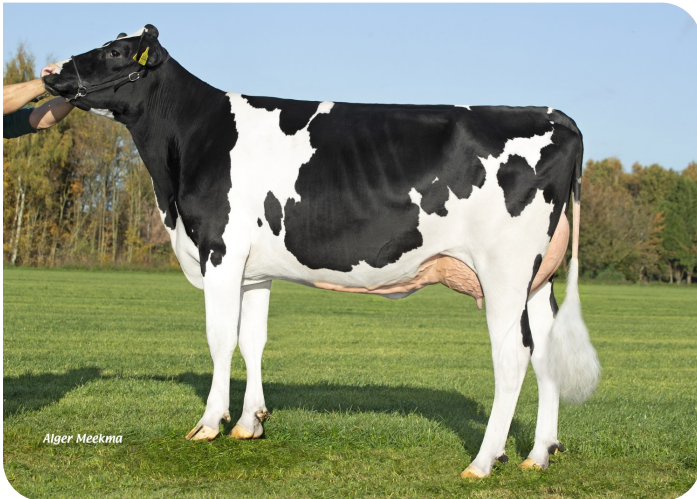
Grashoek Nordika 23 (VG 87)(s. Dex) Owner.: Fok- en melkveebedrijf K.I. SAMEN B.V., Grashoek (NL)