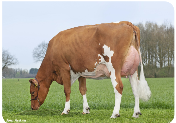
Grashoek Nordika 25 (s. Dex)

Owner: Fok- en melkveebedrijf K.I. SAMEN B.V., Grashoek (NL)