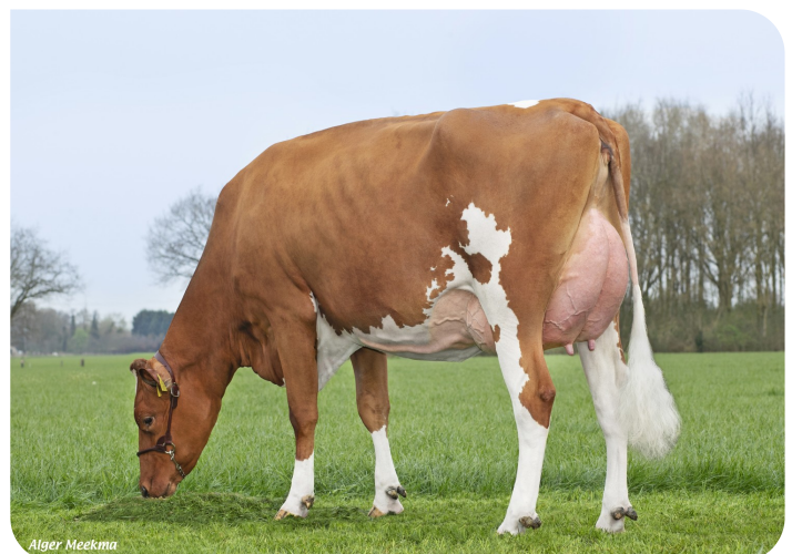
Grashoek Nordika 25 (s. Dex) Owner.: Fok- en melkveebedrijf K.I. SAMEN B.V., Grashoek (NL)