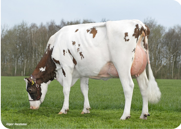
Grashoek Anna Jacoba 13 (s. Dex) Owner.: Fok- en melkveebedrijf K.I. SAMEN B.V., Grashoek (NL)