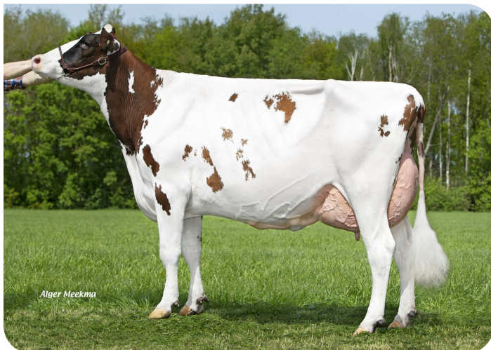
Grashoek Anna-Jacoba 13 (s. Dex)

Owner: Fok- en melkveebedrijf K.I. SAMEN B.V., Grashoek (NL)