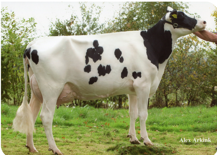
Massia 9397 RF van de Peul (VG 87) Grand-dam of Dex