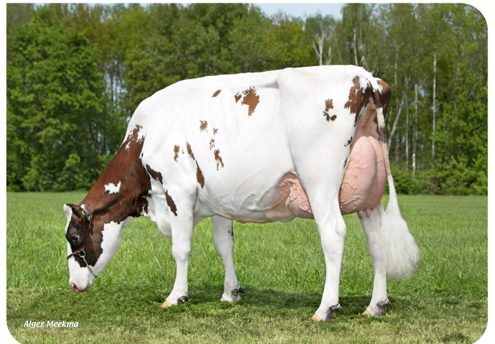
Grashoek Anna-Jacoba 13 (s. Dex) Owner: Fok- en melkveebedrijf K.I. SAMEN B.V., Grashoek (NL)