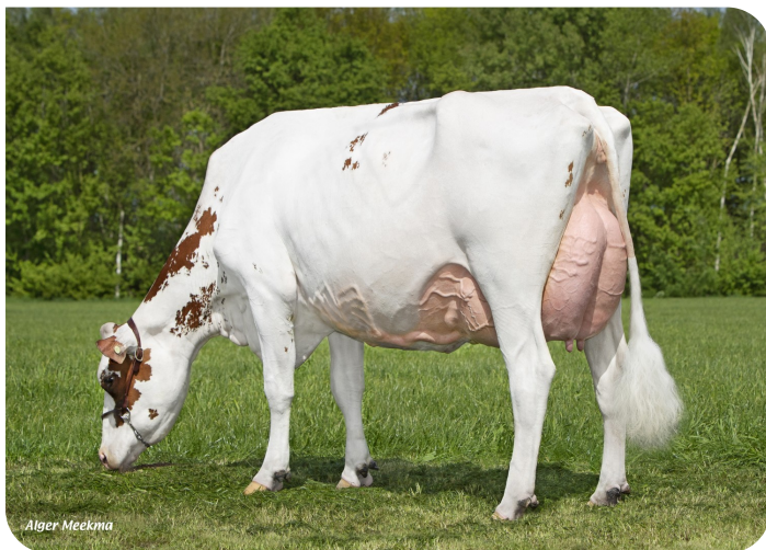
Grashoek Thracia 4 (s. Dex) Owner: Fok- en melkveebedrijf K.I. SAMEN B.V., Grashoek (NL)