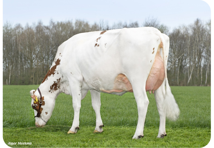
Grashoek Thrinicia 4 (s. Dex) Owner.: Fok- en melkveebedrijf K.I. SAMEN B.V., Grashoek (NL)