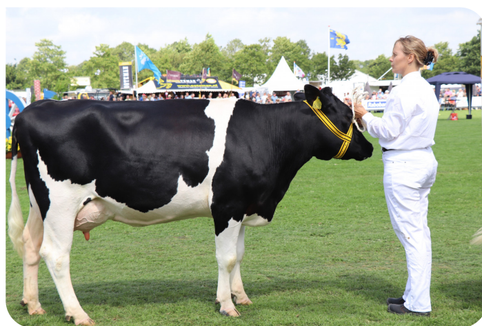
Jet 183 (s. Bas 8)