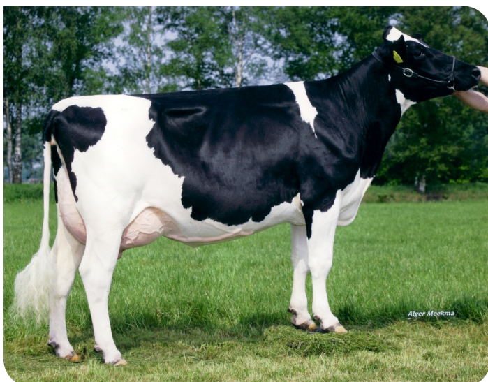
Big Super Star 32 (VG 85) (dam of Snow Ball)