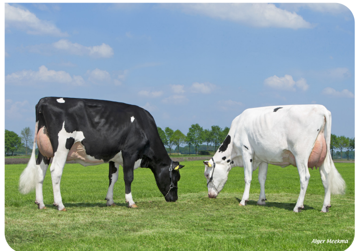
Roosje 1 (s. Snow Ball) & Grietje 65 (s. Snow Ball)