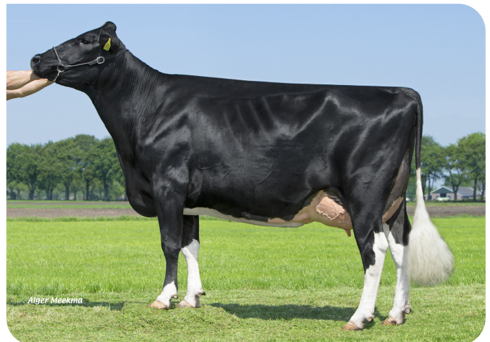
Big Anna Jacoba 126 (VG 87) (s. Shogun PS) (fullsister of Sentaro)