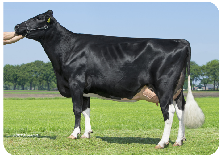
Big Anna Jacoba 126 (VG 87) (s. Shogun PS) (fullsister of Sentaro)