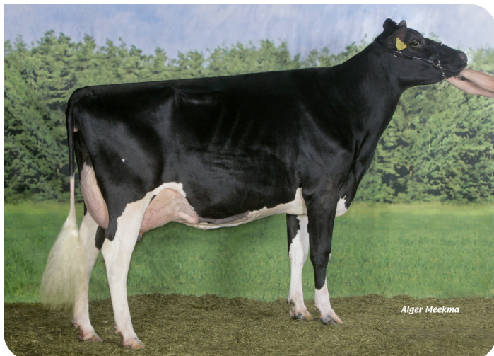
Big Anna Jacoba 115 (EX 90) (dam of Sentaro)