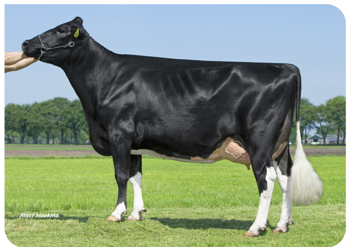
Big Anna Jacoba 126 (VG 87) (s. Shogun PS) (fullsister of Sentaro)