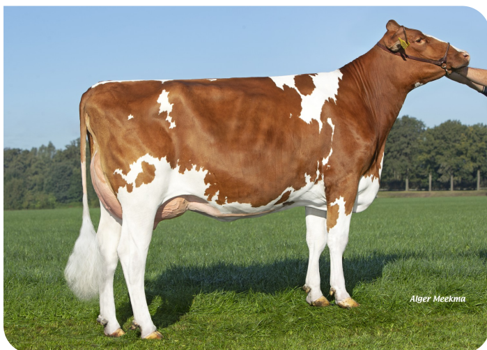
Angels Holdi 563 (s. Redstar) Owner: Angels Holsteins, Meijel (NL)