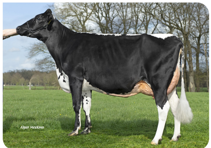
Angels Holdi 563 (s. Redstar) Owner: Angels Holsteins, Meijel (NL)