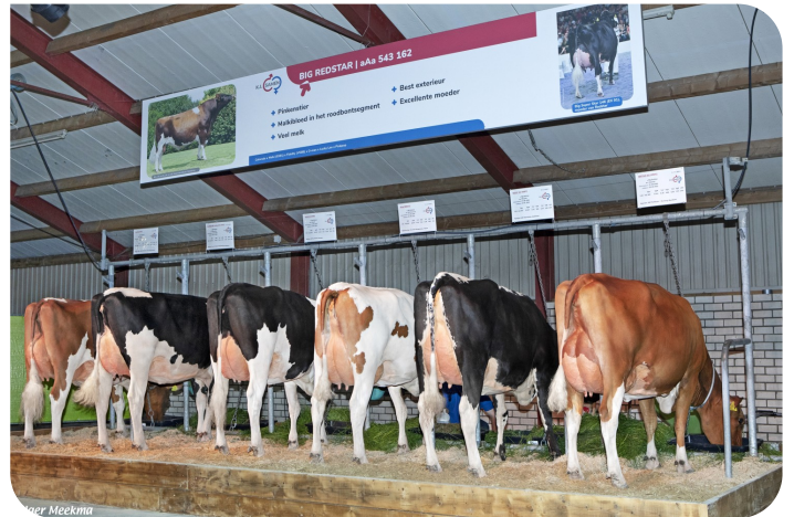
Offspring Big Redstar, Grasdag 2023 Grashoek (NL)