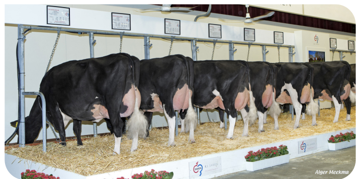
Malki daughter group NRM 2019