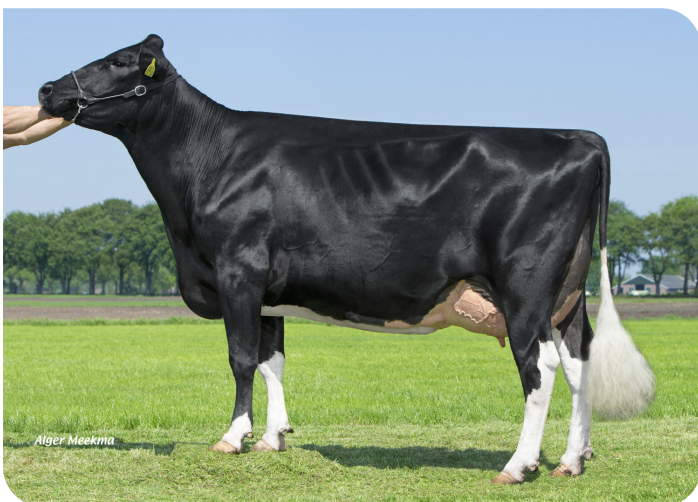
Big Anna Jacoba 126 (VG 87) (s. Shogun PS) (halfsister of Clyde)