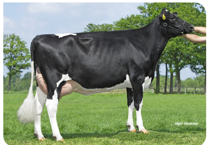
Ynskje 168 (s. Clyde)