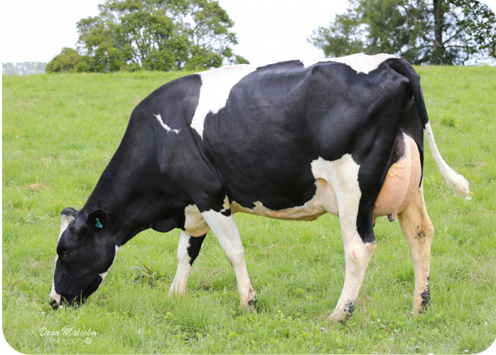
Akkersma Clyde Star (s. Clyde) Owner: Akkersma (NZ)