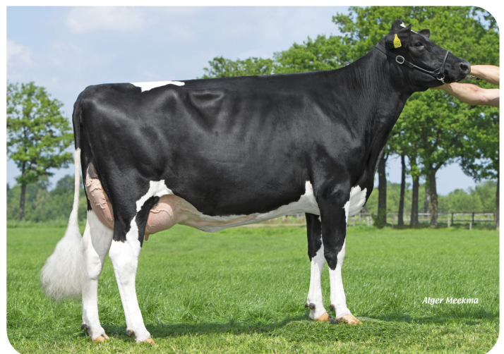
Ynskje 168 (s. Clyde)