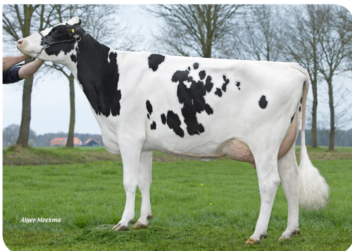
Sonja 99 (s. Clyde)