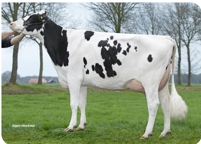
Sonja 99 (s. Clyde)