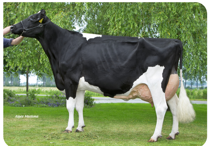
Beeze Roza 48 (EX 90) (dam of Maikman)