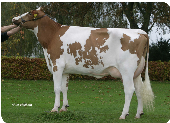
RUW Berta (grand-dam of Beeze Jesley P)