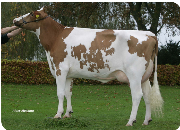
RUW Berta (grand-dam of Beeze Jesley rf (Pp))