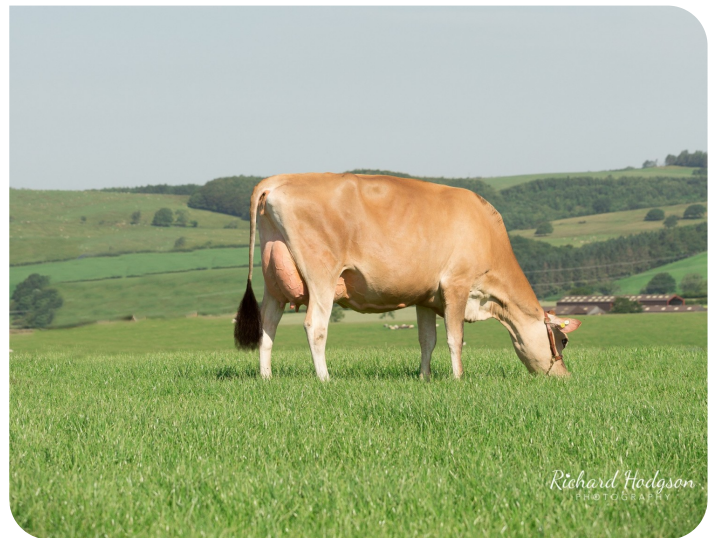
Bayview Chrome Elsie 26 (dam of Explore)