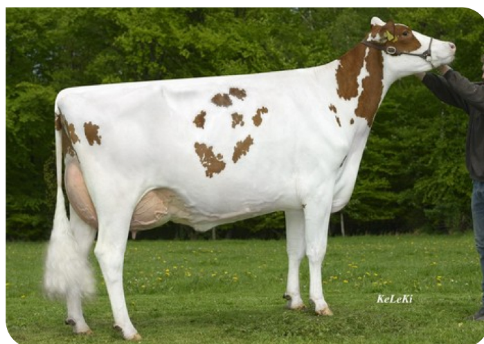
All-Star Jotan Bella (EX 92) (dam of Patbull Red)