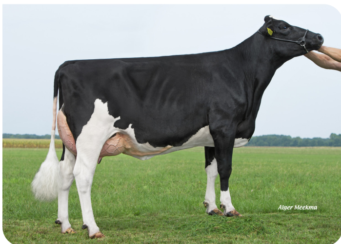
Etta 131 (s. Geronimo)