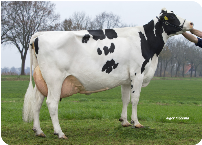
Batenburg Ginster 2047 RF (VG 89) (dam of Geronimo rc)