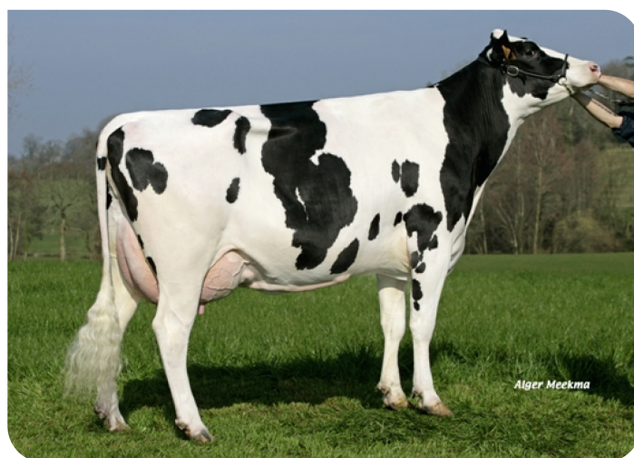
BBH Bebie (full-sister of Basman)