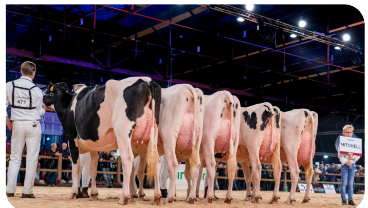
Mitchell daughtergroup HHH-show 2022