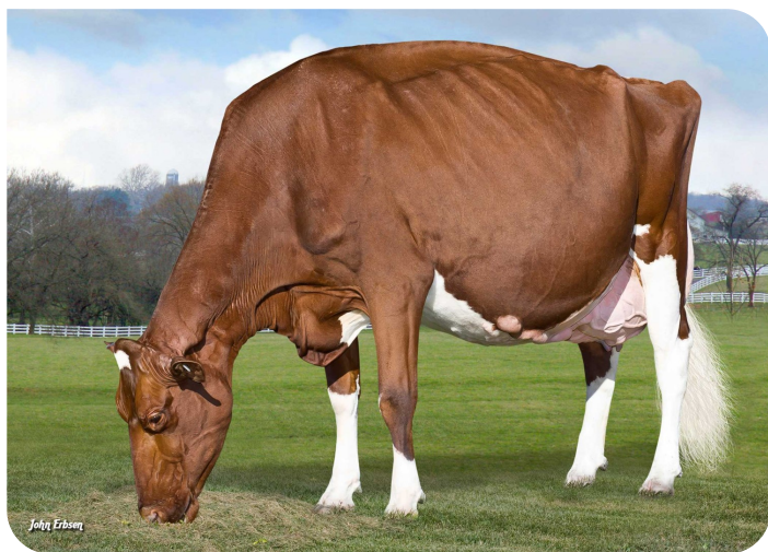
KHW-Regiment Apple-Red (EX 96) (dam of Challenger-Red)