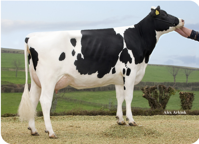
Apina Massia 172 (VG 87) (grand dam of Movistar)