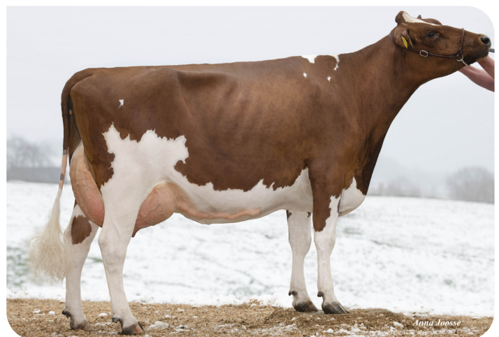
Massia 270 (VG 89) (full sister of Movistar)