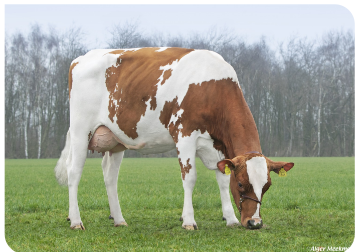
Grashoek Hanna 1844 (s. Movistar)

Owner: Fok- en melkveebedrijf K.I. Samen B.V., Grashoek (NL)