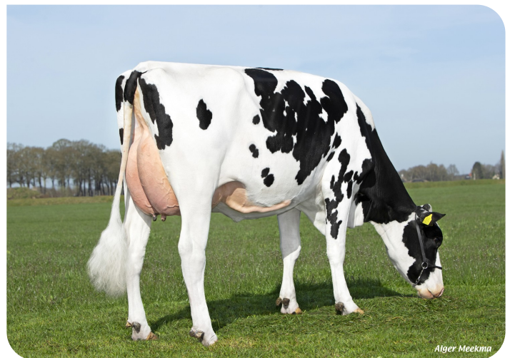
Apina Nadja 167 (s. Movistar) Owner: Melkveebedrijf Coppelmans VOF, Beerzerveld (NL)