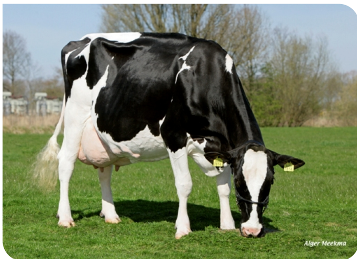
Amsweer Dina 290 (VG 86) (dam of Super-Joc)