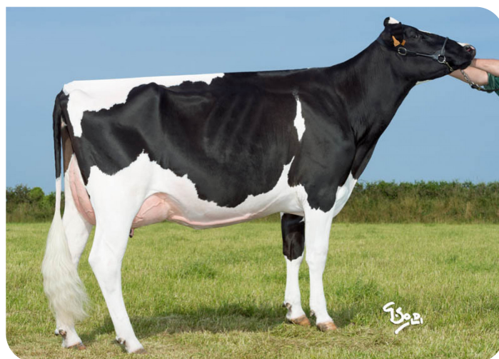
Gazelle 55 (great-great-granddam of Alexis rc (PP))